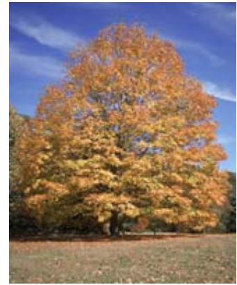
Sugar Maple ( Acer saccharum )