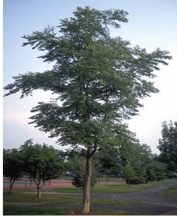
Kentucky Coffee Tree ( Gymnocladus dioicus )