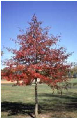
Black Gum ( Nyssa sylvatica )