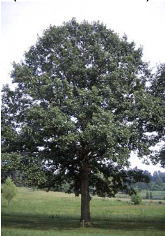
Swamp White Oak ( Quercus bicolor )